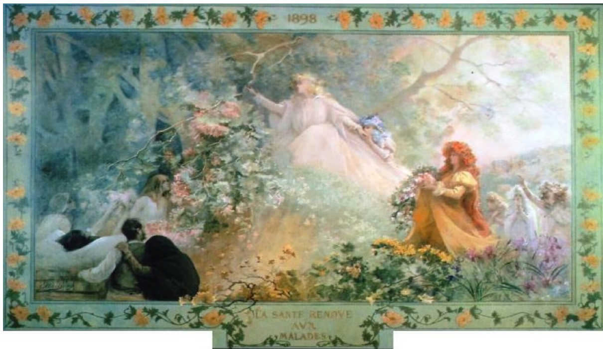
Georges Clairin, 1898 Health Restored to the Sick , fresco painted in the Broca Hospital Paris. Now in the possession of l'Assistance Publique, Paris. The model for 'Health' was Sarah Bernhardt.

patients included writers, actresses and singers, the hostesses of the salons of Paris and the guests who frequented them; private surgical patients included de Maupassant, Alexander Dumas, the literary Goncourt brothers and composers Delibes and Massenet. And somehow, in addition to his demanding professional work and his extensive social life, Pozzi found time to write: dozens of papers for surgical journals, and the preparatory notes for what was to become for many the seminal text of women's healthcare– the Treatise of Gynecology that would bring together everything known at that time about the diseases of women and their treatment.