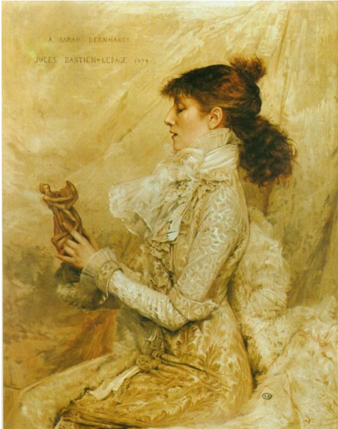
Mme Sarah Bernhardt by Jules Bastien Lepage, 1879

shows that such assertions are baseless. Pozzi's reputation in the English-speaking world has suffered as a result of speculations about a liaison with Amélie Gautreau, a vapid and uneducated dilettante, while his much more interesting and substantial relationship with Bernhardt has been largely ignored. Here then to remedy this situation is the story of the Diva and her Doctor God.