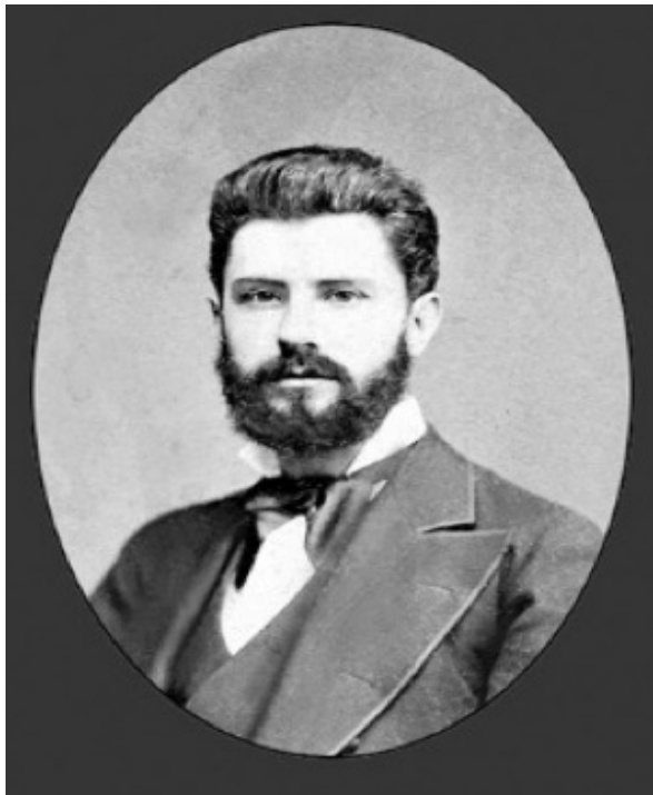
Samuel Pozzi at the age of 22, medical student in Paris