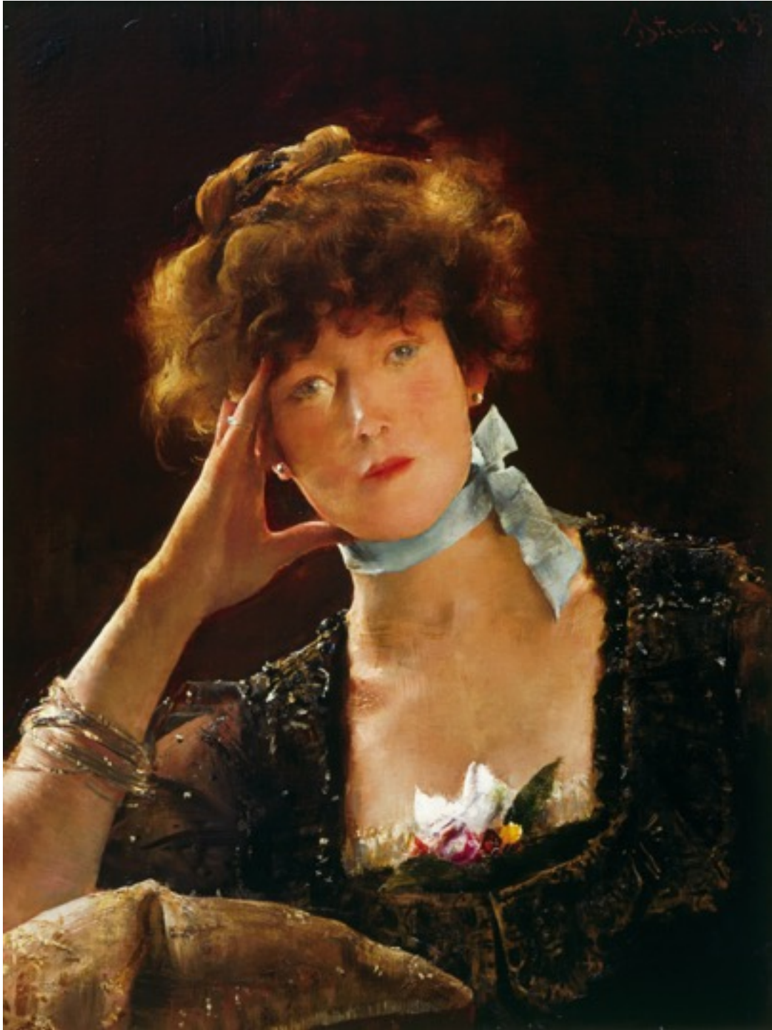
Sarah Bernhardt by Alfred Stevens