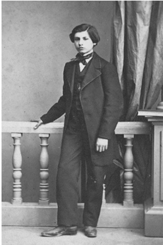
Samuel Pozzi at the age of 16

Insert the following images over several pages between these two chapters