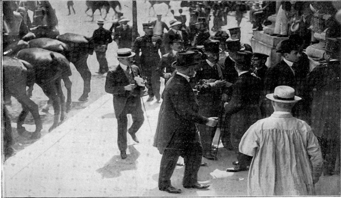
Blessé, le commandant Dreyfus (en chapeau haut de forme, au centre du groupe, et le poignet soutenu par le docteur Pozzi, en uniforme d'académicien) est accompagné à la mairie du Panthéon pour un premier pansement.

wrath of anti-Semites throughout France. Three years later, on the 100th anniversary of the printing of J'accuse! , France's Roman Catholic daily paper, La Croix , finally apologized for its anti-Semitic editorials during the Dreyfus affair.