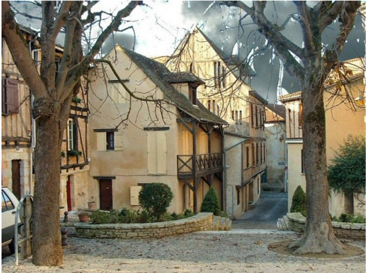
The Old Town of Bergerac as it is today